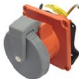
100 Amp Pin & Sleeve Receptacle