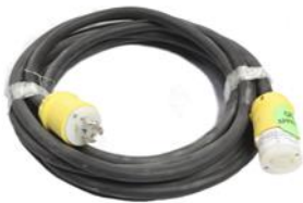
30 Amp, 25' ft. long Extension Cord & Twist Lock