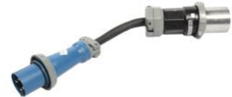
200 Amp x 100 Amp, 26" long Adapter Cord