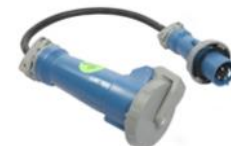
100 Amp x 30 Amp, 36" long Adapter Cord