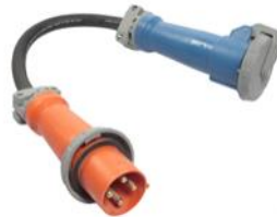
100 Amp x 100 Amp, 36" long Adapter Cord