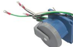
30 Amp Pin & Sleeve Re- ceptacle