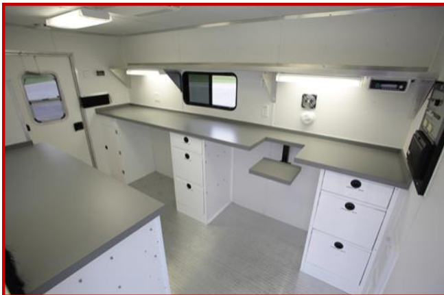
Fiber Optic Splicing Trailer

Provides ample room for a controlled splicing environment and plenty of storage for all your fiber optic supplies.