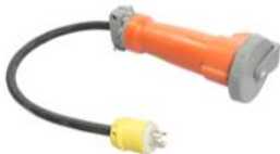
100 Amp x 30 Amp, 36" long Adapter Cord